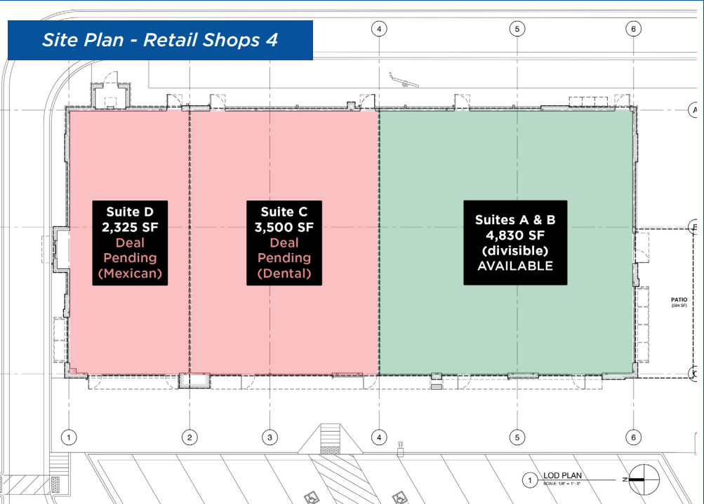
Rendering - Retail Shops 4